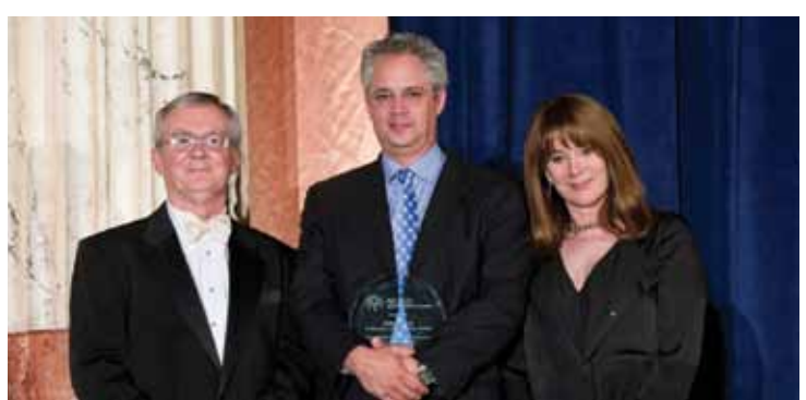
Genentech award presentation