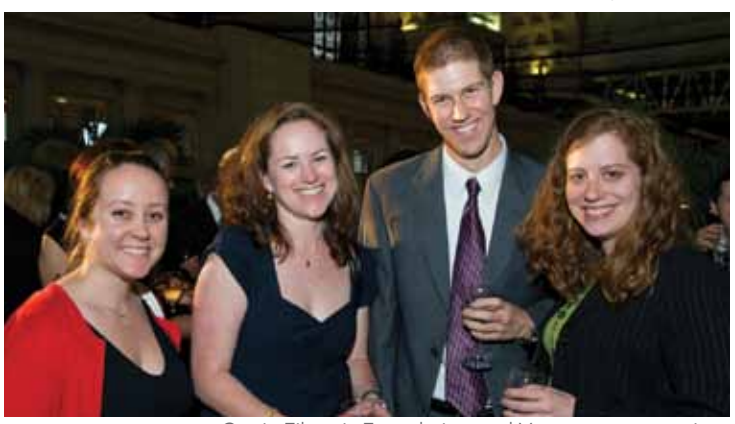
Cystic Fibrosis Foundation and Vertex representatives